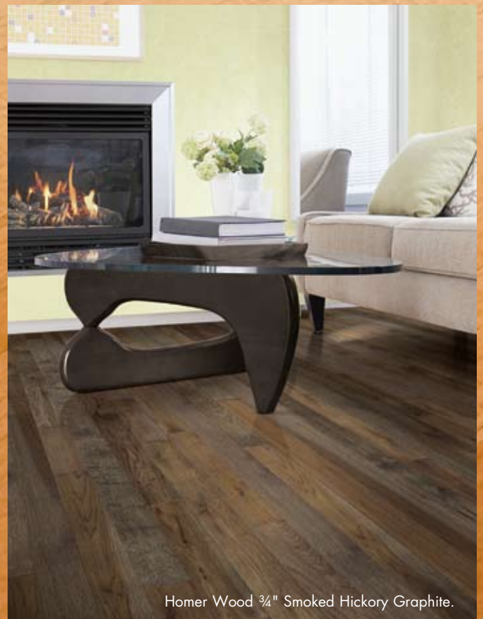
Homer Wood ¾" Smoked Hickory Graphite.

What's not to love about wood floors? They get lovelier by the year as daily life adds character and charm, reflecting your home's history.... like the American Classics Collection Biltmore Maple Plank from Mannington Hardwood shown above.